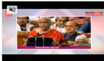
Budget 2023: PM Sitharaman provides Rs 35,000 cr outlay to achieve energy transition

"India is moving forward to net-zero carbon emissions by 2070. An outlay of Rs 19,700 crore for the Green Hydrogen Mission will facilitate transition to low carbon intensity and also reduce dependence on fossil fuels," she said in her Budget speech.