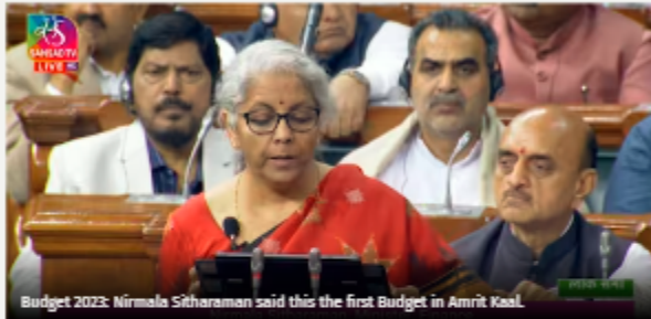
Budget 2023: Nirmala Sitharaman said this the first Budget in Amrit Kaal.

PTI • Last Updated: FEBRUARY 01, 2023, 13:28 IST • New Delhi, India