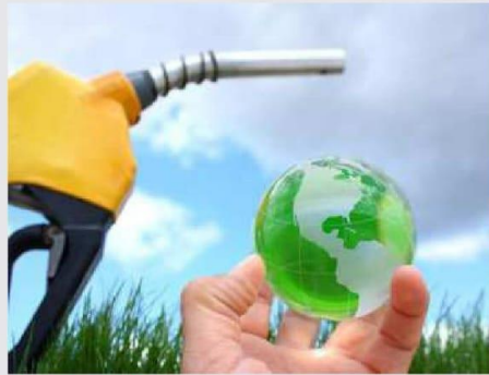
ALTERNATIVE. The Centre has been promoting the use of compressed biogas as an alternative green transport fuel

The Government has been promoting the use of compressed biogas as an alternative green transport fuel, which is produced through anaerobic decomposition of waste/ biomass sources, including municipal solid waste.